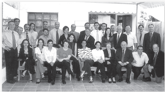
Cyprus and North Cyprus Bi-communal workshop.