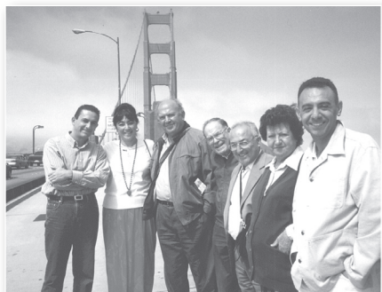
B-communal teachers workshop in Oakland.