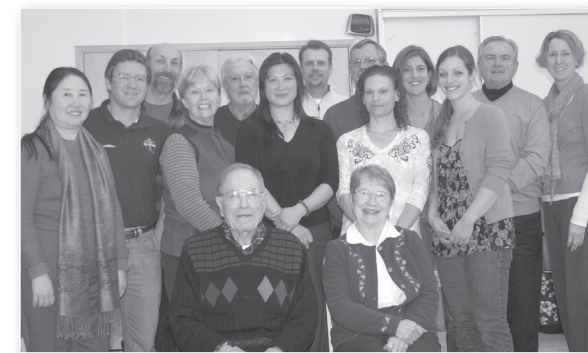
Board Members and guests at the CGP Annual Meeting, January 2011.