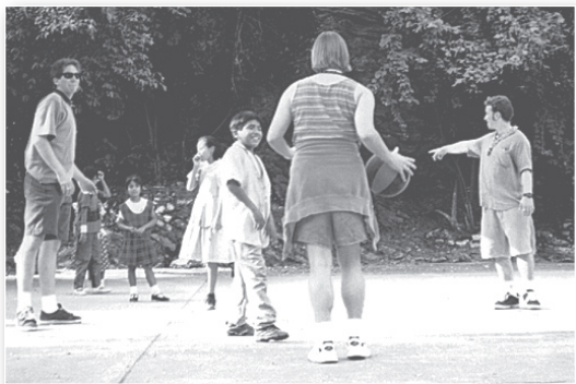
Mexico school playground.